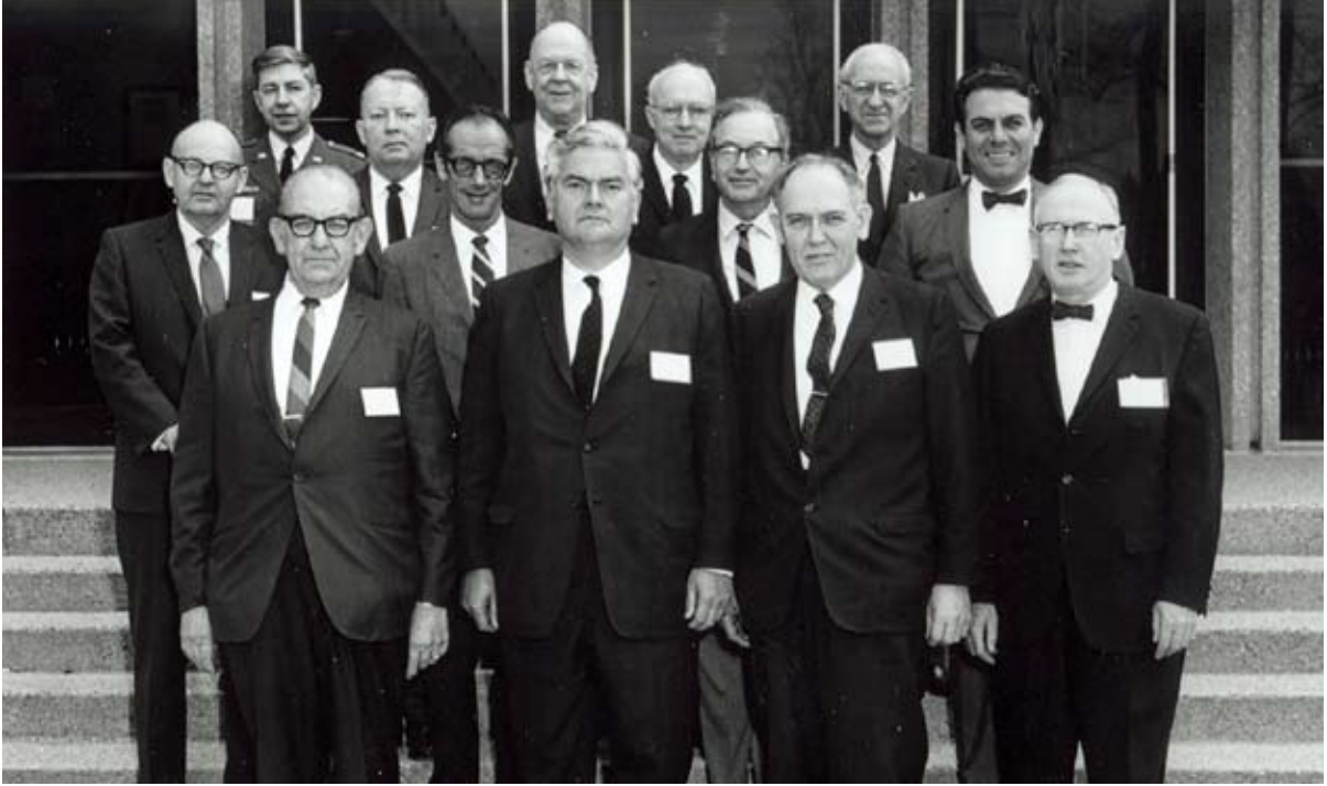
(Above) The first NEI National Advisory Eye Council meeting, April 3–4, 1969.