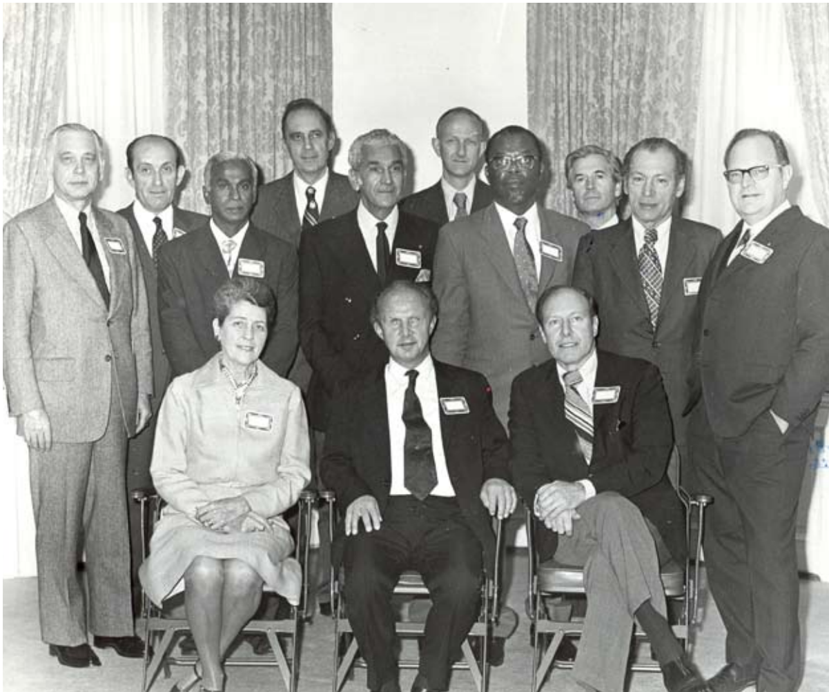
(Above) The Priorities and Projects Committee of the newly established International Agency for the Prevention of Blindness, November 1975.